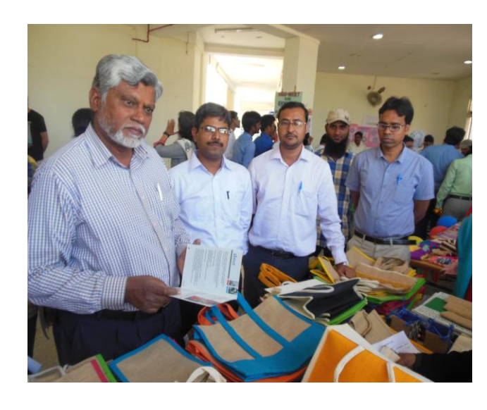
NGO Meet cum Exhibition at Department of social work