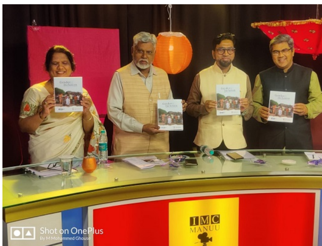
Webinar at MANUU expresses concern over increasing cases of Gender violence