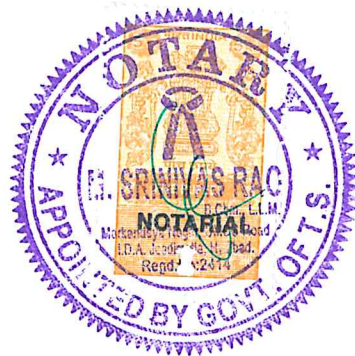
Signature of staff