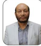
پروفیسر سعید عین الحسن وائس چانسلر مانو، حیدرآباد