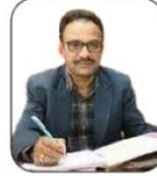
پروفیسر شیخ اشتیاق احمد رجسٹرار مانو، حیدرآباد