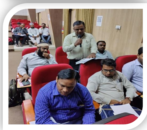
Participants interacting during the sessions