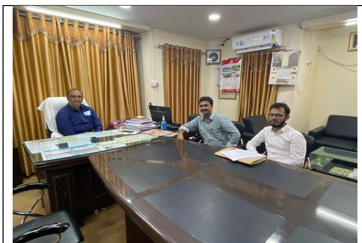
Meeting with the Director, Telangana State Urdu Academy, Hyderabad (November 12, 2021)