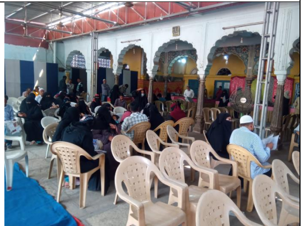
Parents in search of prospective grooms/brides