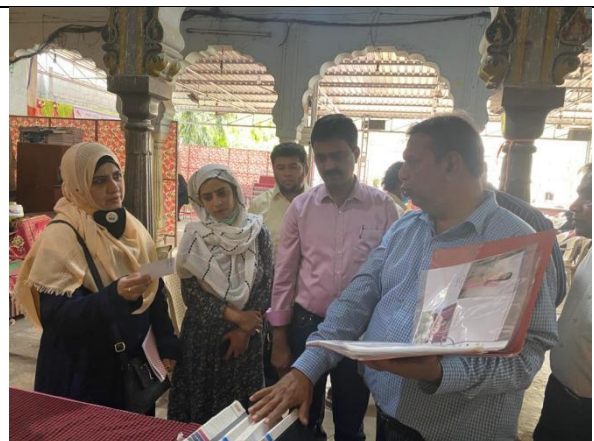
Team Interaction with the Organisers