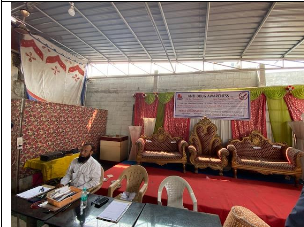
Awareness Programme-Anti Drug