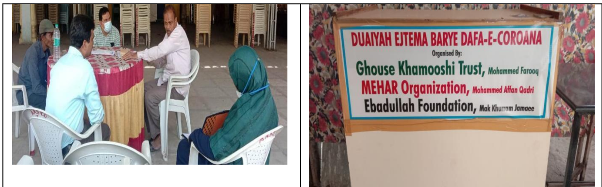
Interaction with the representatives of Mehar Organisation about the problems faced by unmarried Muslim girls in old city of Hyderabad (14.10.2021)

The members of centre had a fruitful interaction with the organizer of Mehar Organisation which conducts interactive programs for the parents of prospective brides and grooms in the old city of Hyderabad. They narrated the travails of the parents in getting married their girls in terms of finding suitable boys, spending money on dowry, household items and problems for performing second marriages.