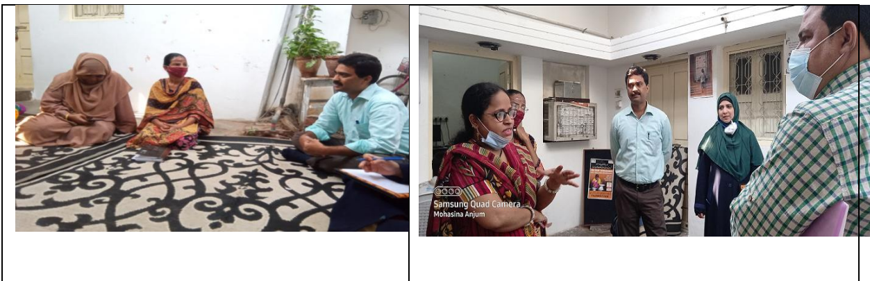
Interaction with staff of Shaheen Resource Centre and programme participants, Hyderabad (14.10.2021)

As a part of Centre’s Function “Establishing links with Civil society Organizations engaged in combating Social Exclusion” the Alberuni Centre for the Study of Social Exclusion and Inclusive Policy (ACSSEIP)’s team has made a visit to the old city of Hyderabad on October 14, 2021, to meet the NGOs involved in the Muslim and Dalit women empowerment activities and the beneficiaries of women’s empowerment programmes taken up by NGOs like Shaheen Resource Centre and Mehar Organisation in the old city of Hyderabad. Shaheen has a centre each at Siddique Nagar, Aman Nagar, Valmiki Nagar and Hassan Nagar areas, the most vulnerable and prone to communal disharmony.