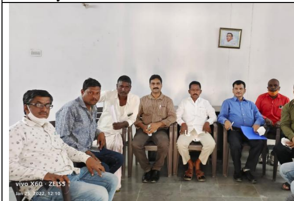
A view of interaction with Gram Panchayat staff by the Centre's Director and other Staff members