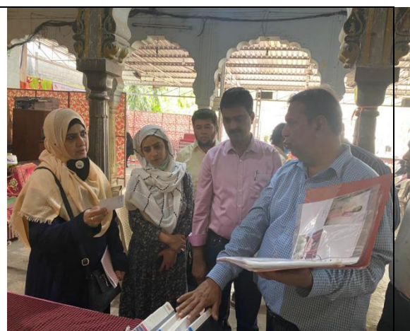
Team Interaction with the Organisers