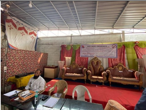
wareness Programme-Anti Drug