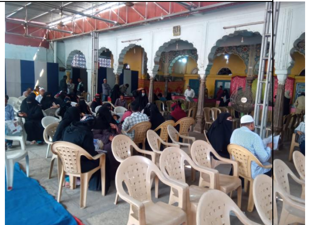
Parents in search of prospective grooms/brides