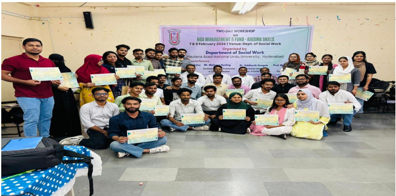
Post Valedictory Group Photo Session: Participants, Resource Persons, Convener of Workshop and Head of Department of Social Work