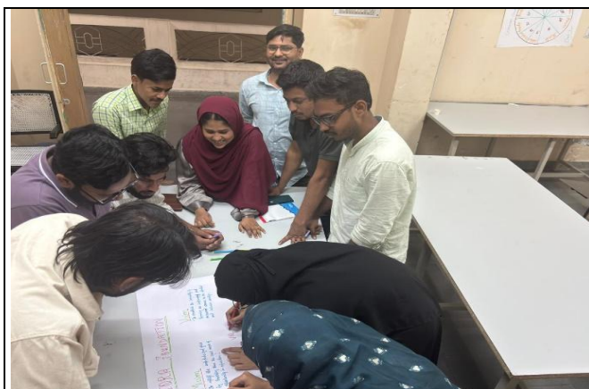
Participants' Engagement During Group Activity

A total of 52 participants benefitted from the workshop. Participants include students from the Social Work Department, Department of Sociology, and Department of Computer Science at Maulana Azad National Urdu University. Students of Osmania University also participated in the workshop. Faculty members and research scholars of the Department of Social Work were also actively engaged in the workshop. They all were actively engaged in discussions, raised operational questions, and contributed to group tasks. The participatory format enabled peer learning and practical exposure.