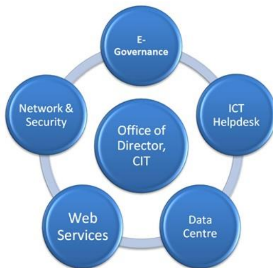
Figure 1: CIT Technical Groups

To achieve the above Vision and Mission, MANUU has initiated refurbishing its Centre for Information Technology. A small team of team of ICT Professionals has been organized into five Technical Groups as shown in the diagram given below: