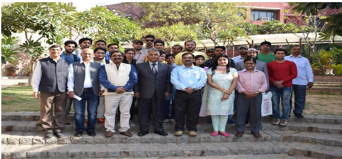
Students of M.A. (JMC) and Chairman, Press Council of India and DG, IIMC, New Delhi during Educational Tour.