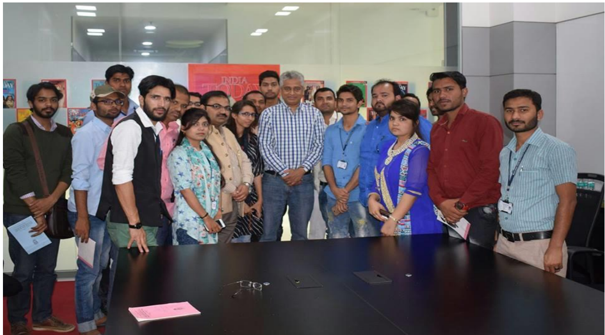
Students of M.A. (JMC) with Mr. Rajdeep Saradesai, Eminent Journalist and Consulting Editor of TV Today Network during Educational Tour at New Delhi.