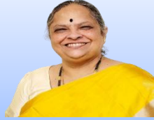
Dean, School of Education and Training