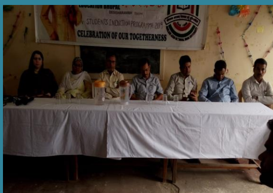
Student Induction Programme-2019 (Principal & Teaching Staff –CTE Bhopal)