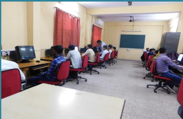
Student to Visit the ICT Lab (Under the Supervision of Sakkeer V.)