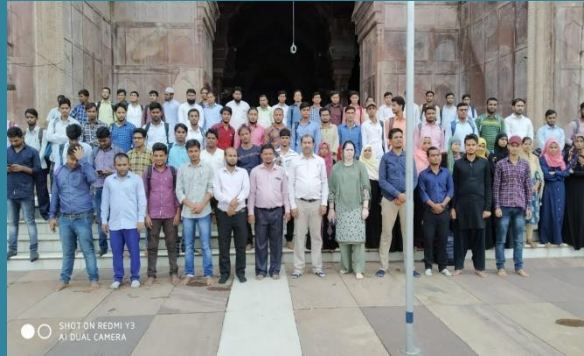
Visit to Historical Monuments (Taj-UL-Masjid) ( Teaching Staff & New Students)