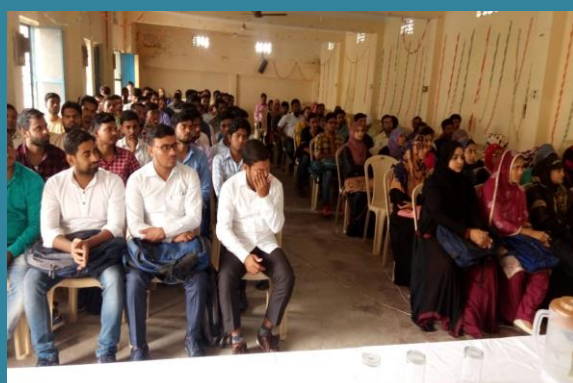
Student Induction Programme-2019 (Newly M.Ed. & B.Ed. Students Participating in the Programme)