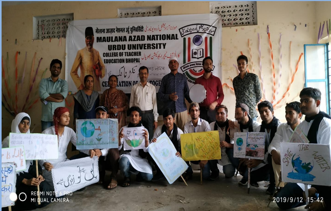
Principal CTE, Bhopal with participants and faculty members.