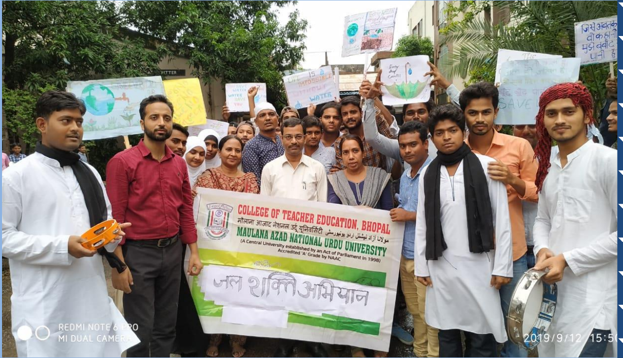
Principal CTE, Bhopal Flagging off the Rally

The students wrote slogans on the topic water and water conservation. All students participated in the rally with eye catching posters and slogans written on placards.