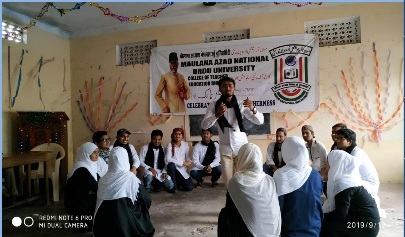
Students performing Street Play on Water Conservation

The Students of B.Ed I Sem Prepared a Street play on the Topic "Water Conservation" giving a message of the importance of water conservation. The students portrayed different life situations focusing on the message to conserve water. The students carefully selected situations where people waste water knowingly or unknowingly. The play gave a strong message on the importance of conserving water as it is a fast depleting resource. The play conveyed messages through songs and dialogues. All the actors of Play were in white kurta with black shawl.