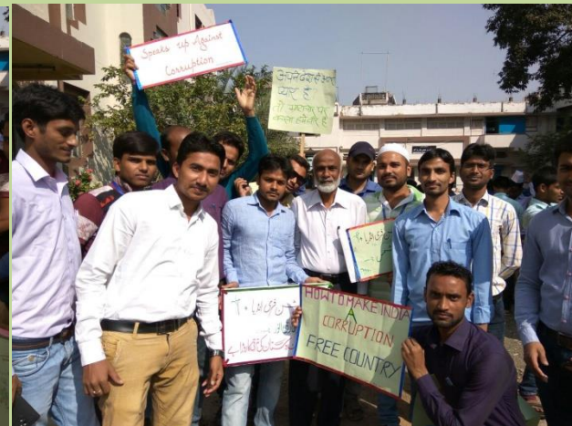
Students with Principal before Walkathon during Vigilance Awareness Week