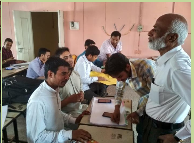
Principal discussing with students about causes of corruption and its remedies