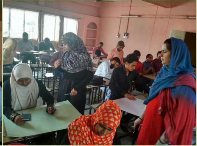
Principal and Faculty inspecting the Poster Making Activities of Students during Vigilance Awareness Week