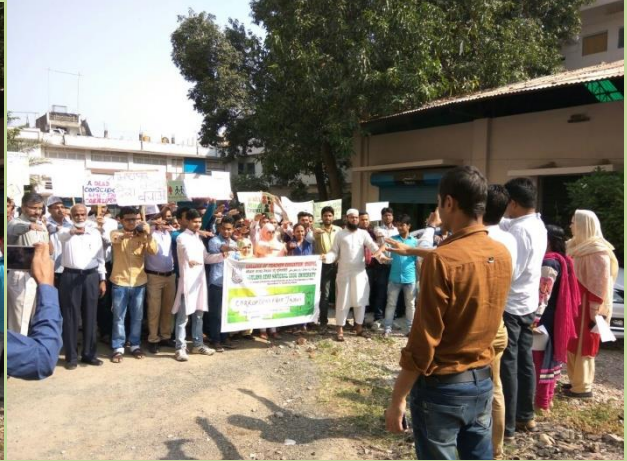
Principal, Staff and Students taking Oath during Vigilance Awareness Week on 4 th Nov 2017