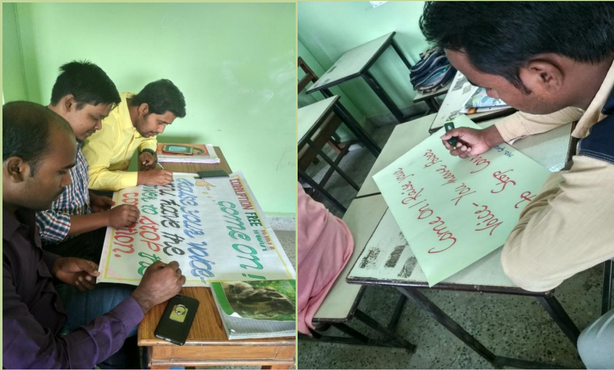
Students participating in Slogen Writing Activities during Vigilance Awareness Week

Central Vigilance Commission aiming at promoting integrity, transparency and accountability in public life has directed us to observe 30 th October 2017 to 4 th November 2017 as Vigilance Awareness Week and the theme decided for this year is "My Vision-Corruption Free India". In this regard Poster Making and Slogan Writing Activities, Oath taking ceremony and Walkathon has been conducted at College of Teacher Education-MANUU, Bhopal on 2 nd and 3 rd of November 2017.