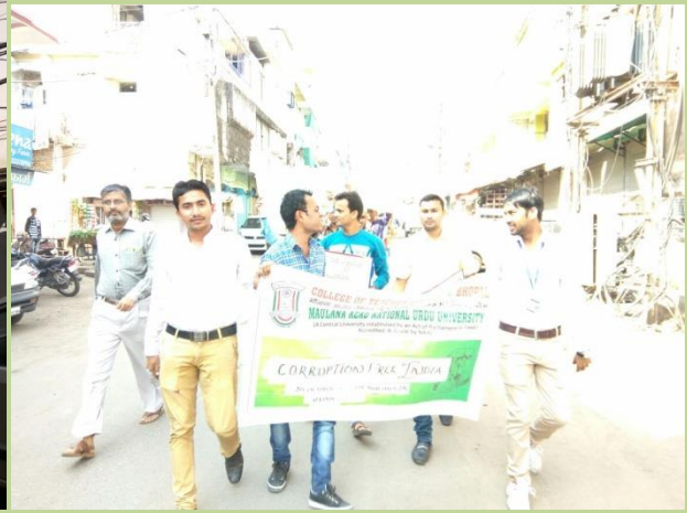
Staff and Students during Walkathon for Awareness of Corruption free India