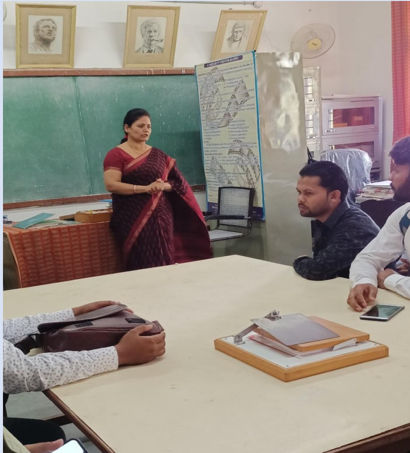
Picture 5: Psychology Tools explained to students by the Faculty of RIE, Bhopal