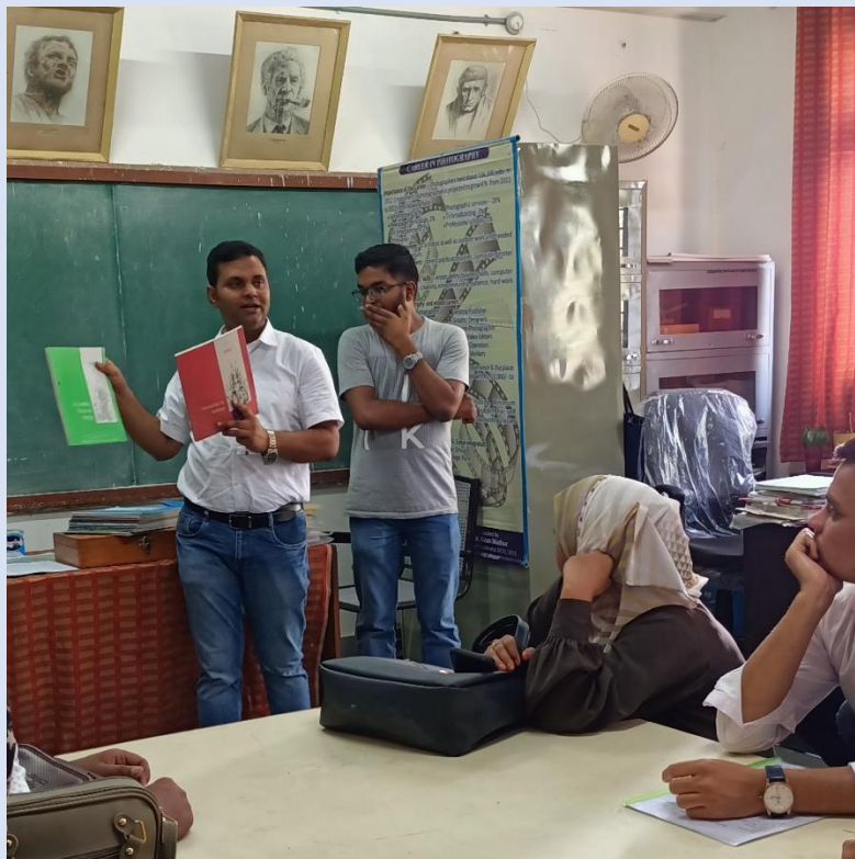
Picture 6: Faculty of RIE, Bhopal oriented about Diploma in Guidance and Counselling Course