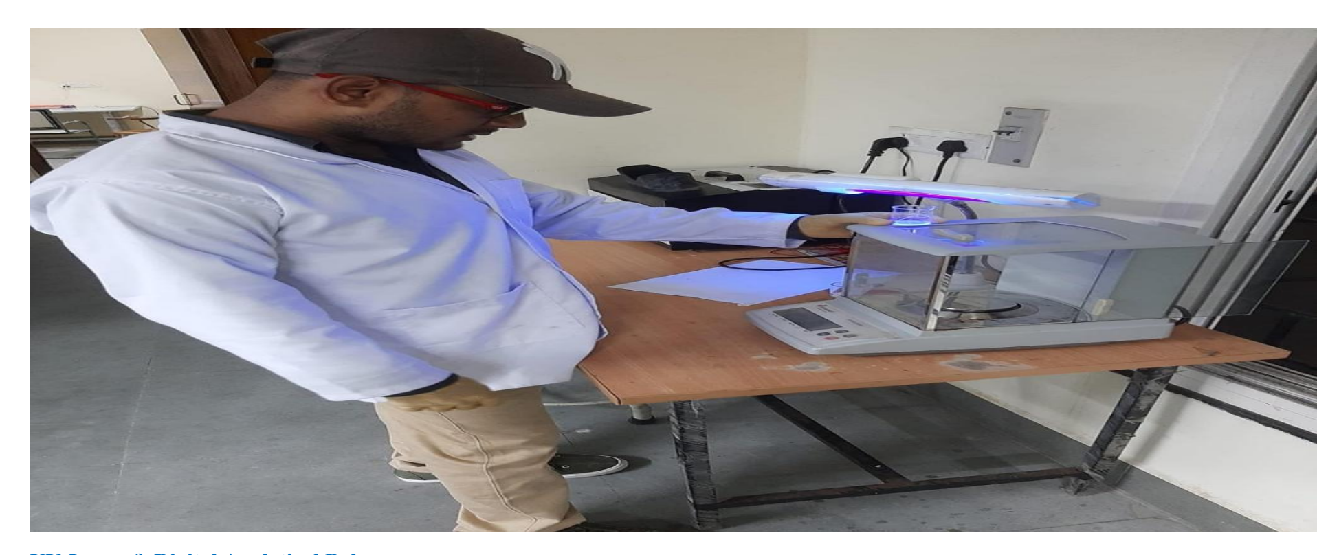
UV-Lamp & Digital Analytical Balance