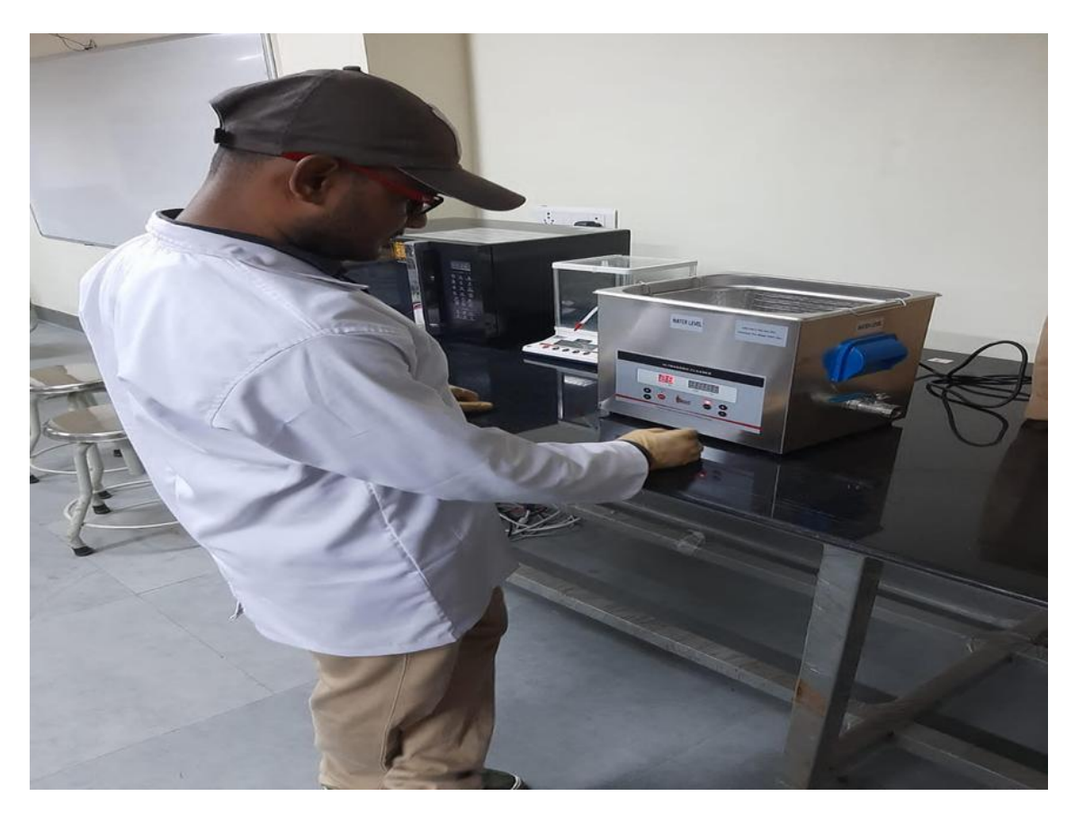
Ultrasonicator & Microwave Oven