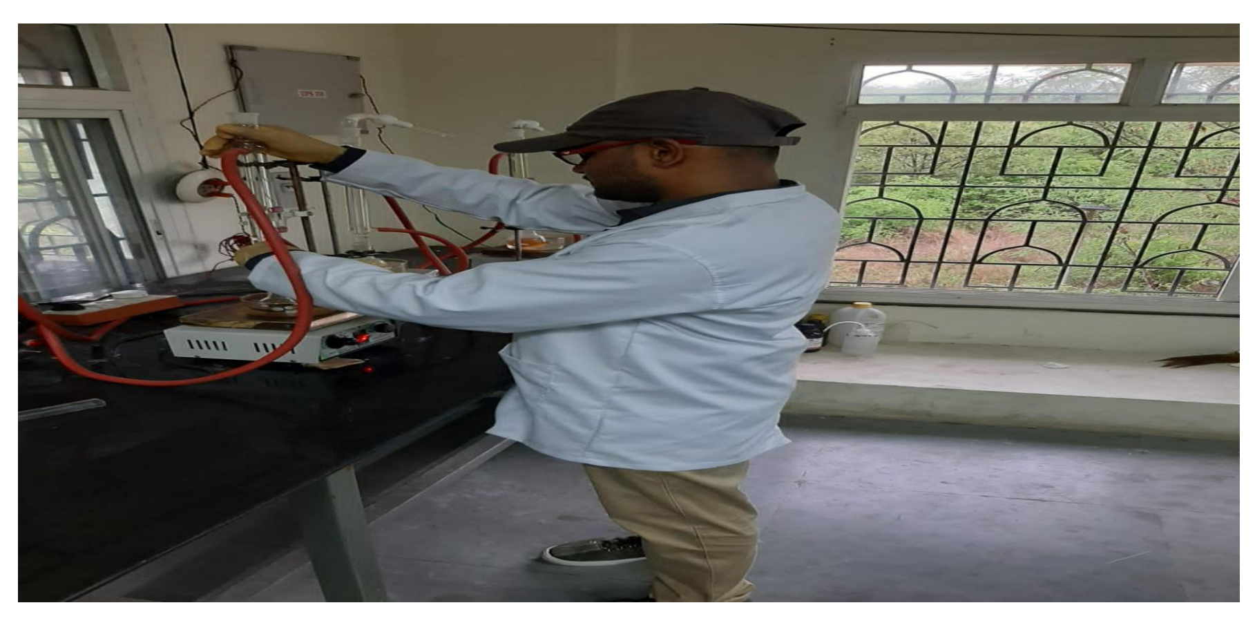
Magnetic stirrer with hot plate