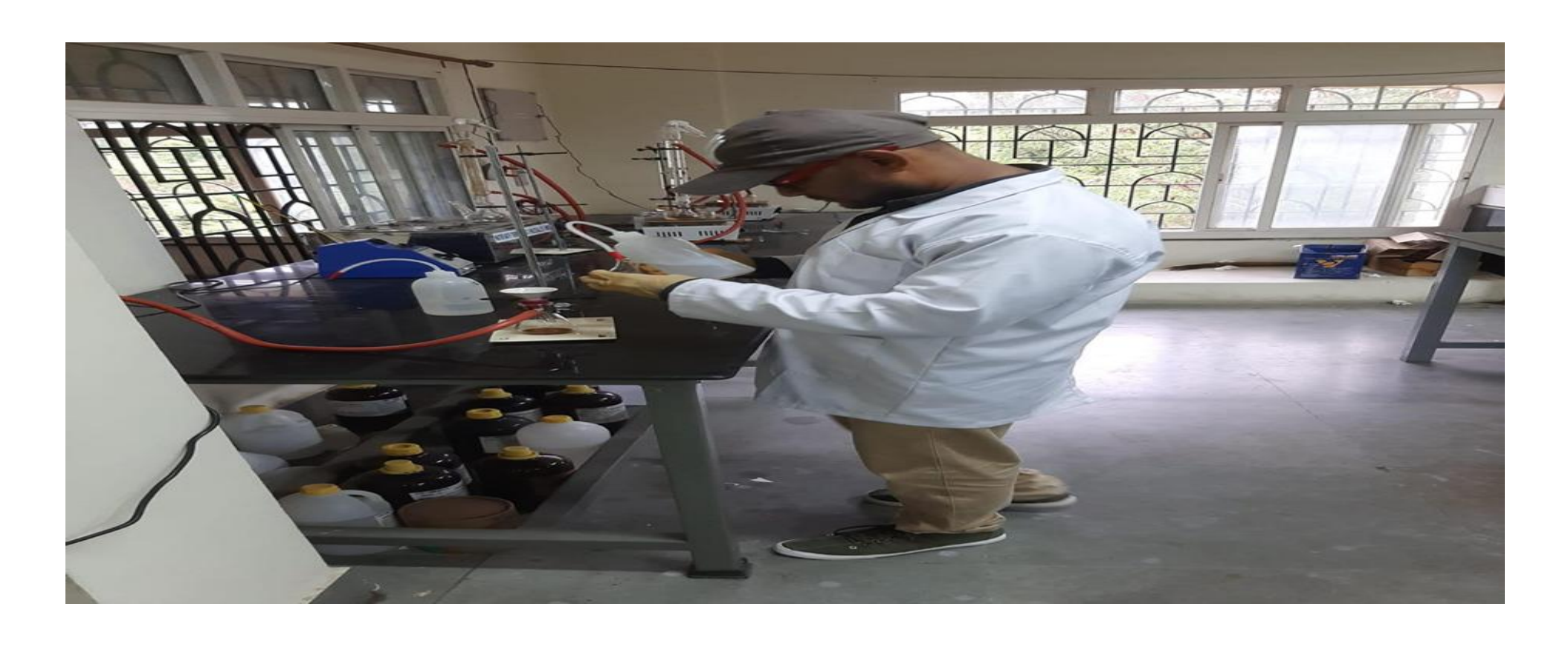
Filtration Assemble & 6 Hole Water bath