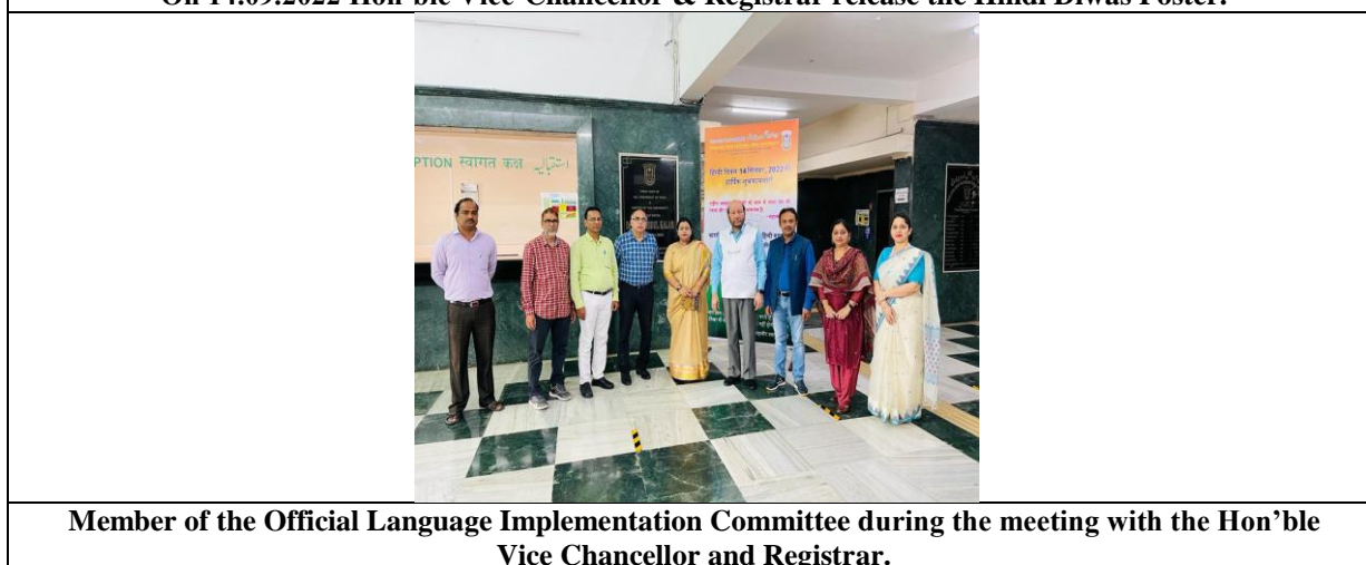
Member of the Official Language Implementation Committee during the meeting with the Hon'ble Vice Chancellor and Registrar.