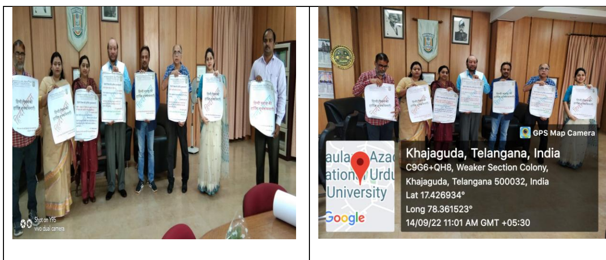
On 14.09.2022 Hon'ble Vice-Chancellor & Registrar release the Hindi Diwas Poster.

For the successful completion of Hindi week, Hindi Officer expressed gratitude to the Hon'ble Vice Chancellor & Registrar and to all the participants of the University.